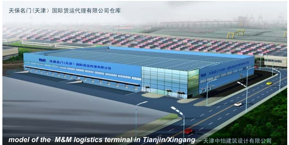
model of the M&M logistics terminal in Tianjin/Xingang 天津中怡建筑设计有限公司